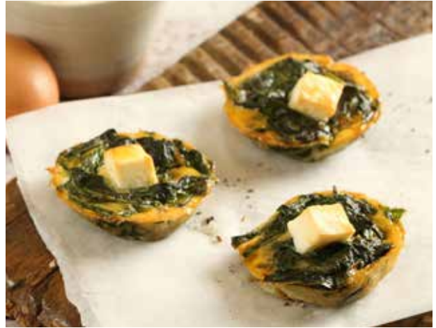
Spinach & Feta (V) (FL)