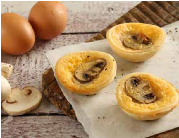
Chicken & Mushroom