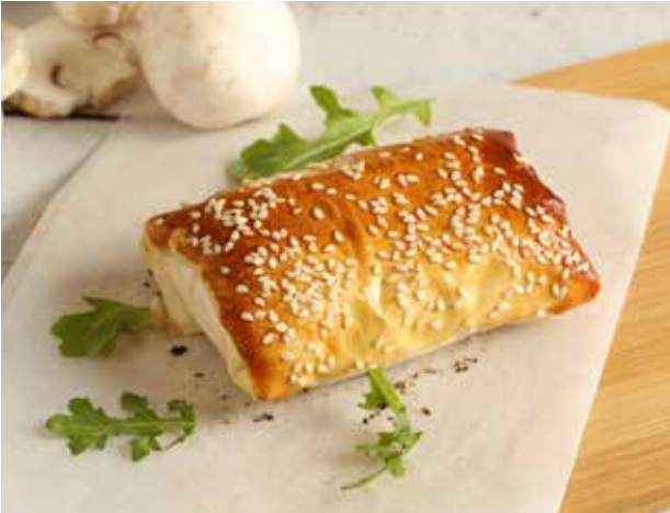
Chicken & Mushroom