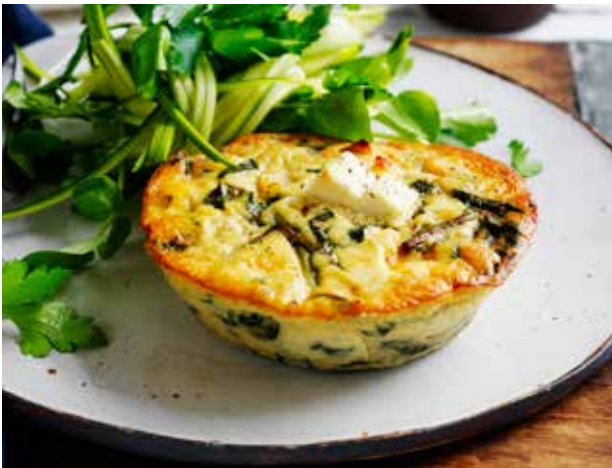
Spinach & Feta (V)