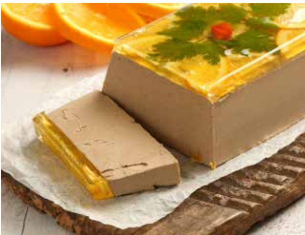
Grand Orange Liqueur