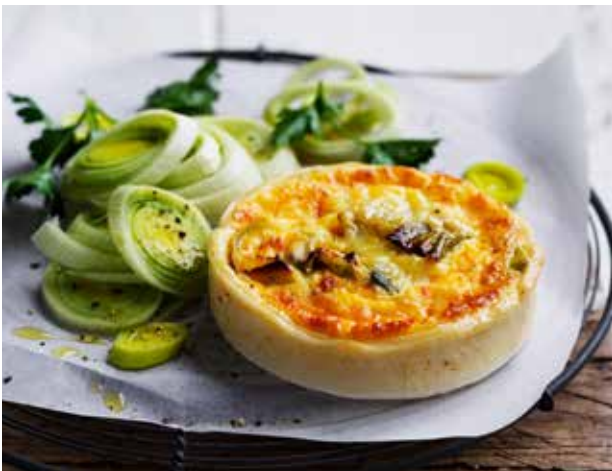
Leek & Cheese (V)