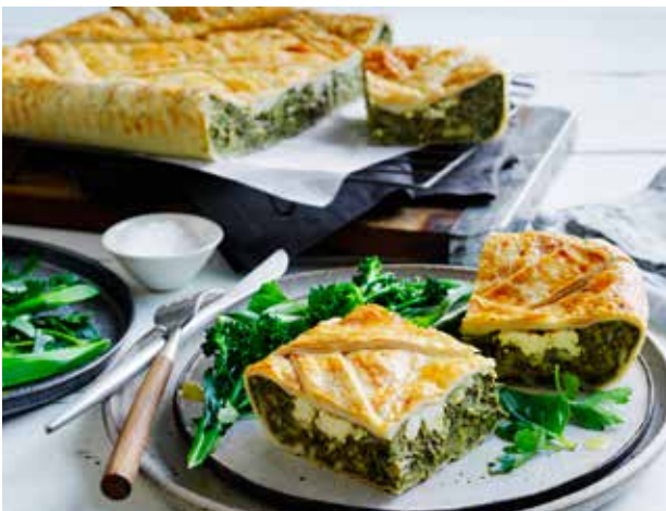
Yaya-Style Spinach Pie (Spanokopita) (V)