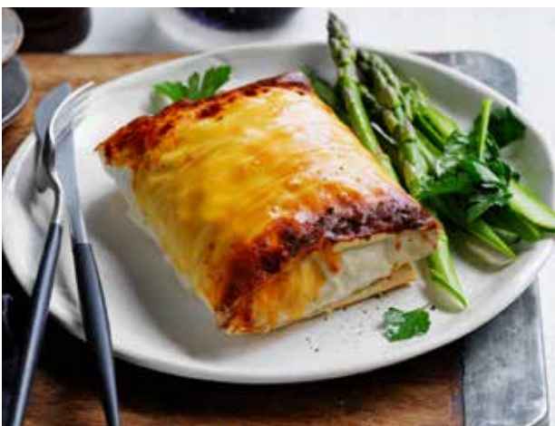
Spinach & Feta (V)