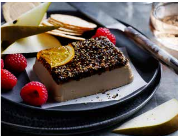
Duck & Cracked Pepper