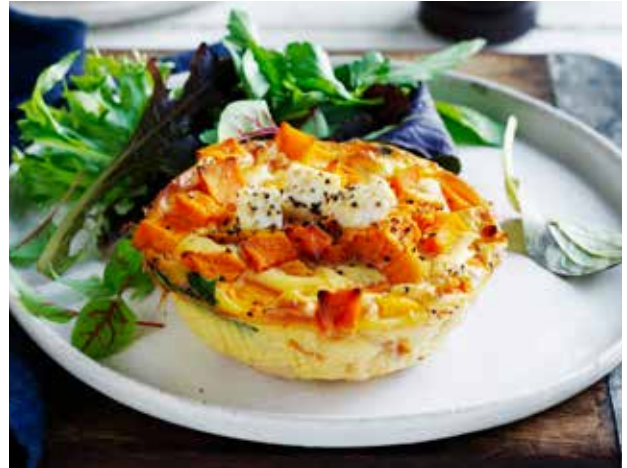
Pumpkin & Feta (V)