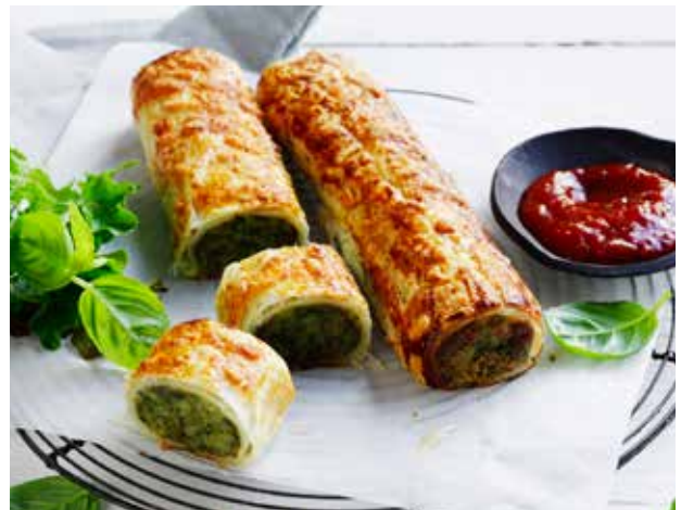
Spinach & Feta (V)