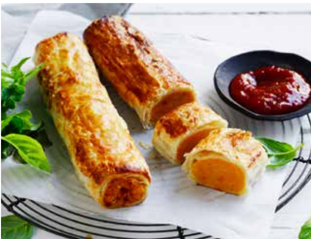
Pumpkin, Ricotta & Chilli (V)