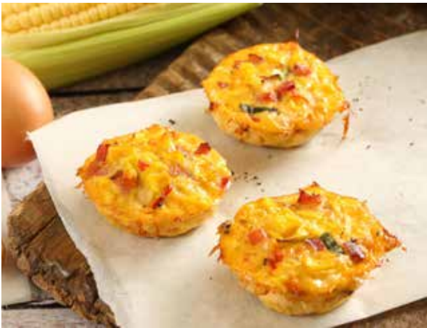
Bacon, Corn & Leek (FL)