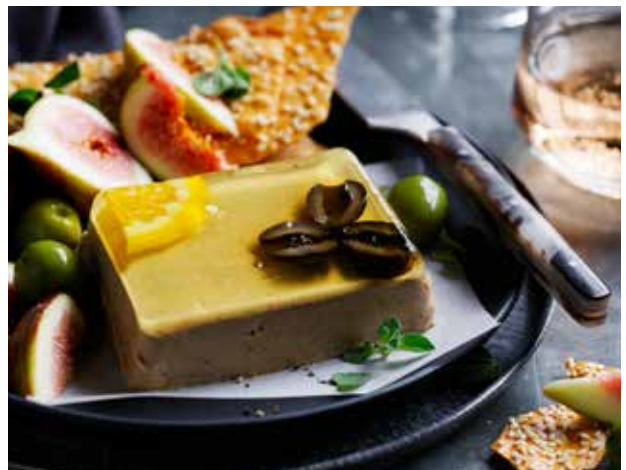
Duck & Orange