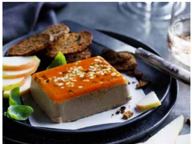
Truffle & Almond