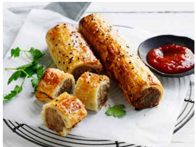
Beef & Fennel