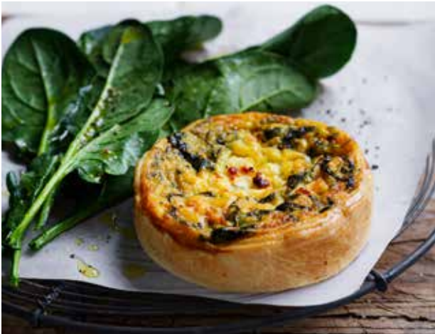
Spinach & Ricotta (V)