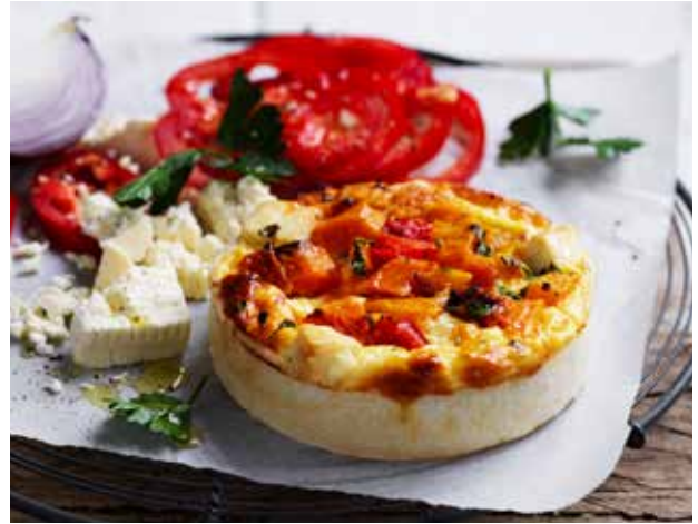
Pumpkin, Feta & Capsicum (V)