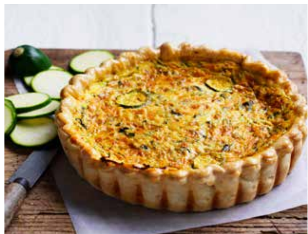
Mixed Veggie (V)