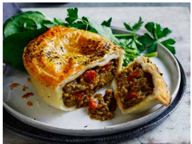
Curry Beef Experience the rich flavors of our Curry Beef Pie, filled with succulent beef, vegetables and aromatic curry spices. A taste sensation.