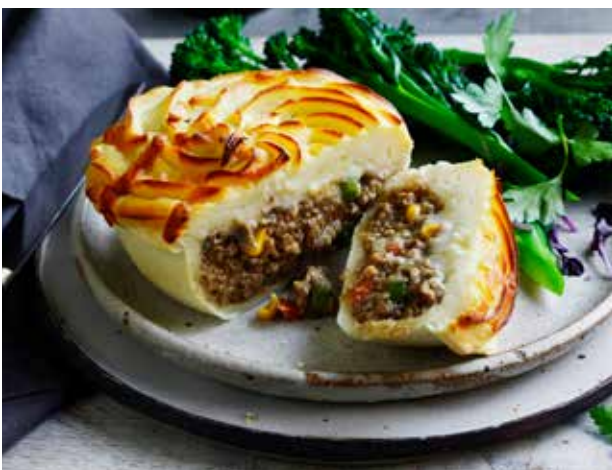
Beef Potato An individual Shepherd's Pie. A Hearty filling of Premium Beef Mince, Onions and Mixed Vegetables encased in our handmade shortcrust pastry and a beautiful potato topping. A true winter warmer!