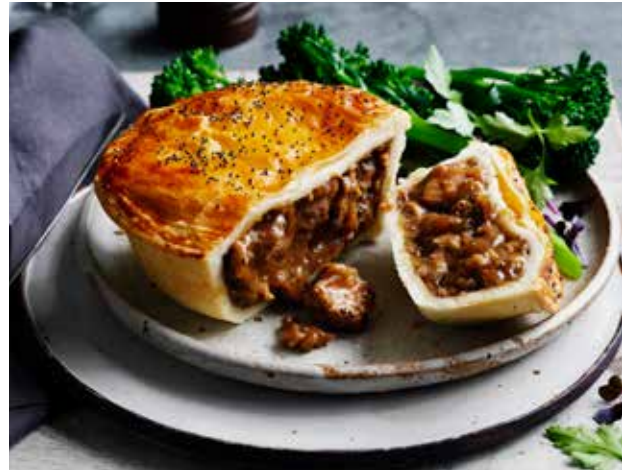
Pepper Steak Indulge in our Beef and Black Pepper Pie, featuring tender beef chunks seasoned with bold black pepper, all encased in a golden, flaky pastry.