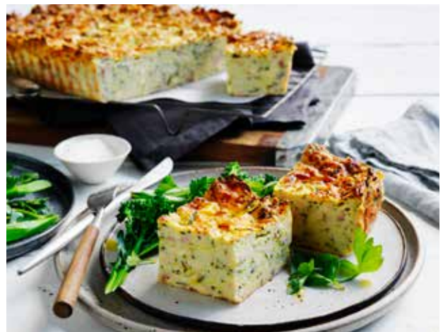
Zucchini Bacon Slice