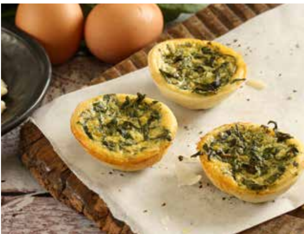
Spinach & Ricotta (V)