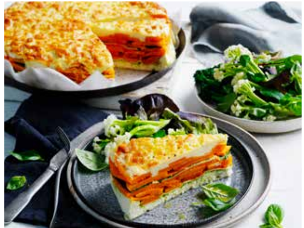
Pumpkin, Pesto & Ricotta Lasagne (V)