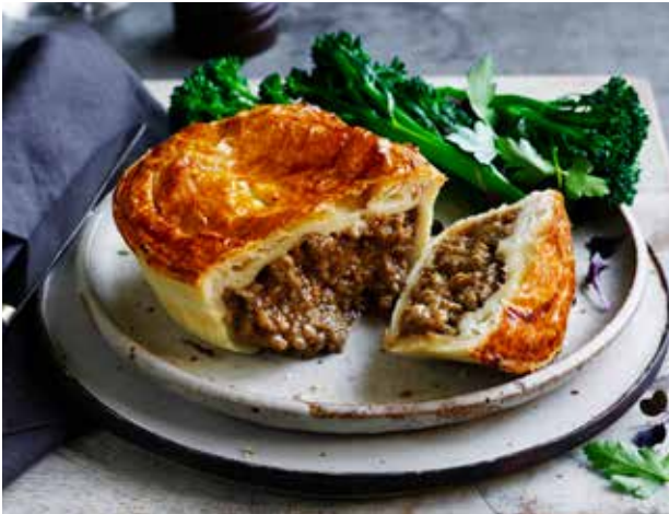
Premium Beef Mince A Posh Foods favourite and an absolute crowd pleaser! Locally sourced Premium beef mince, with rich gravy all encased in a buttery shortcrust pastry with no topping - a true classic.