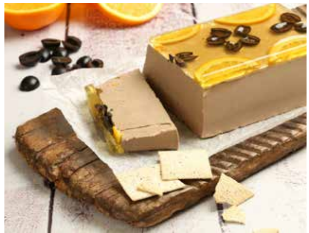
Duck & Orange