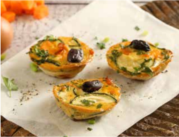
Mediterranean (V) (FL)