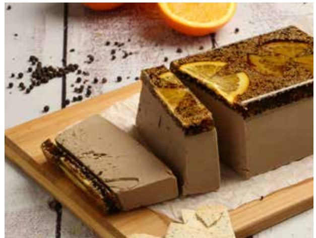
Duck & Cracked Pepper