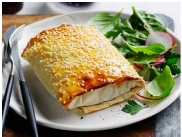
Chicken & Mushroom