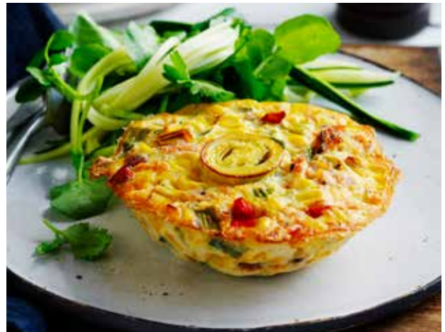
Bacon, Corn & Leek

Our crust-less quiches are packed full of flavour. Made without flour, they are light and easy to digest.