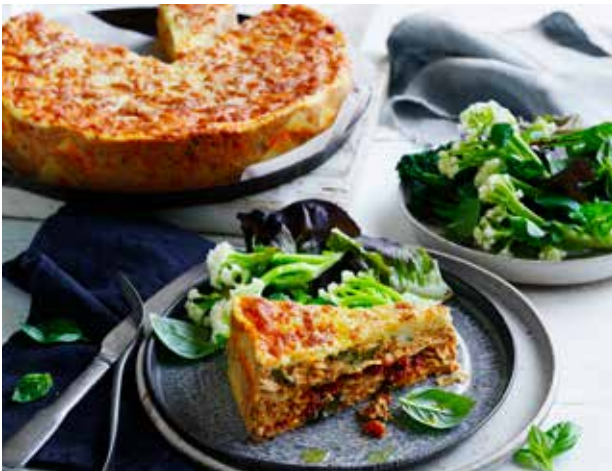
Cajun Chicken & Sundried Tomato Lasagne