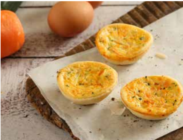
Mixed Veggie (V)