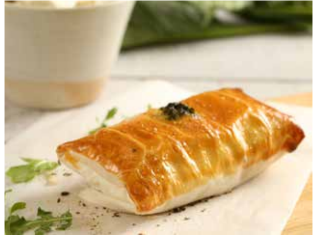
Spinach & Feta (V)