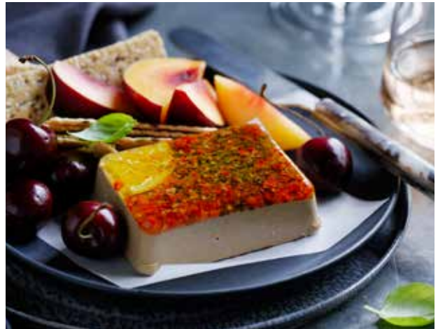
Grand Orange Liqueur