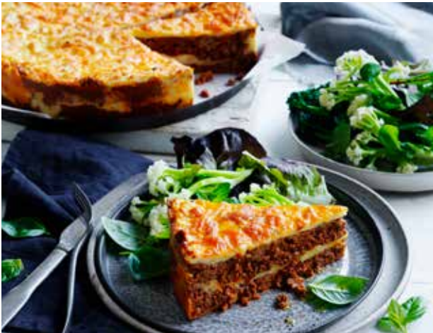
Beef Bolognese Lasagne