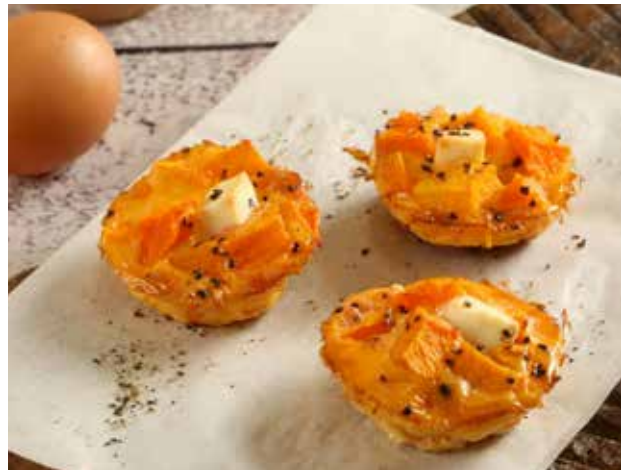
Pumpkin & Feta (V) (FL)