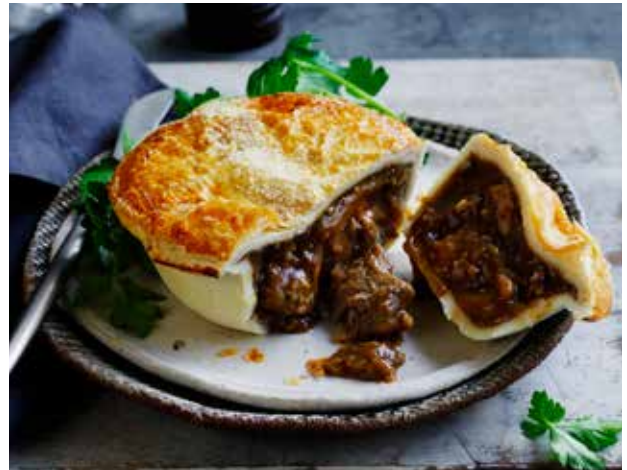
Chunky Beef The ultimate comfort food - rich, tender, chunky beef braised in a flavoursome gravy of caramelized onions, garlic and topped with breadcrumbs. So familiar, so tasty.