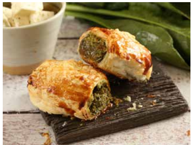
Spinach & Feta (V)