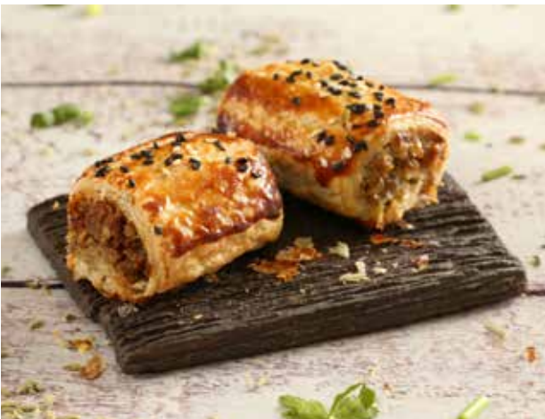
Beef & Fennel