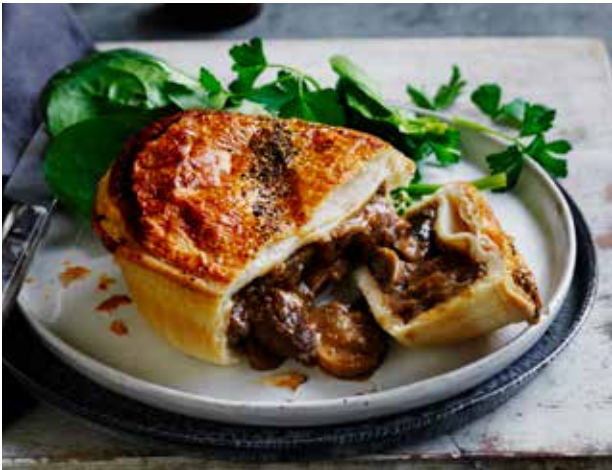
Beef & Mushroom Traditional slow braised beef chunks with mushrooms & bacon, sprinkled black pepper – a classic.