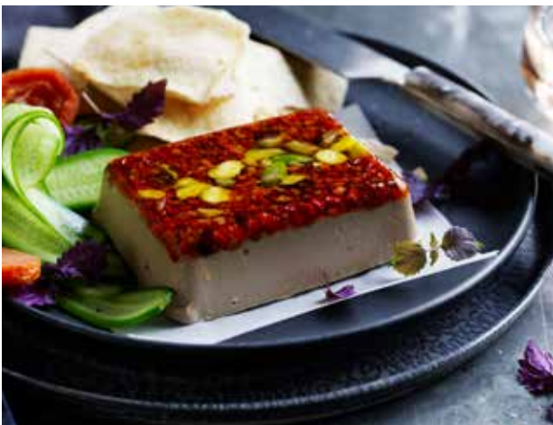
Pistachio & Brandy