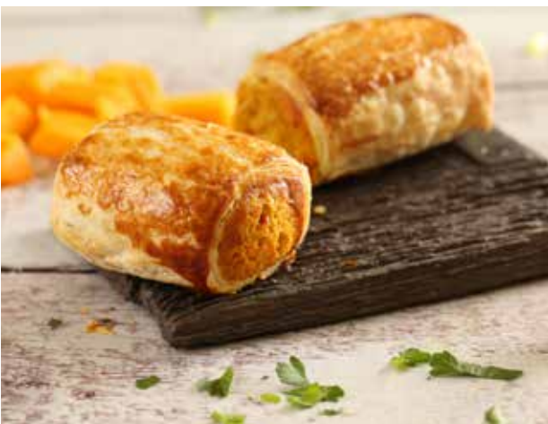
Pumpkin, Ricotta & Chilli (V)