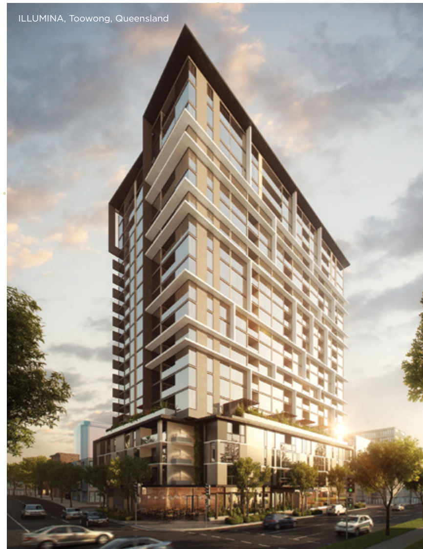
ILLUMINA, Toowong, Queensland

CWG International is one of the most awarded Property Developers in China and has delivered high quality large scale projects surpassing AUD$1.5 Billion in project value consisting of schools, commercial buildings, business parks and luxury residential apartments. CWG International currently has AUD$1.6 Billion in the pipeline in China.