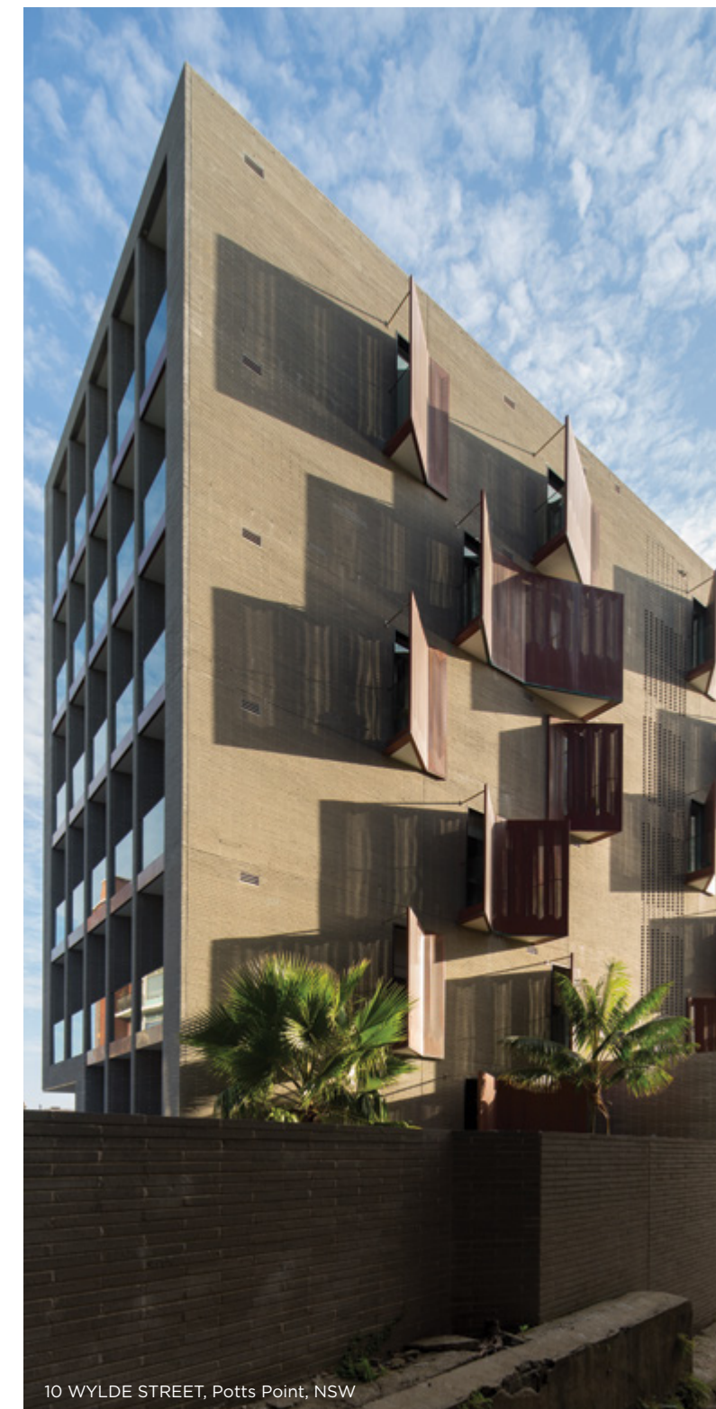
10 WYLDE STREET, Potts Point, NSW

SJB has received a record 45 awards in Australia and internationally for design excellence between 2012-2017.