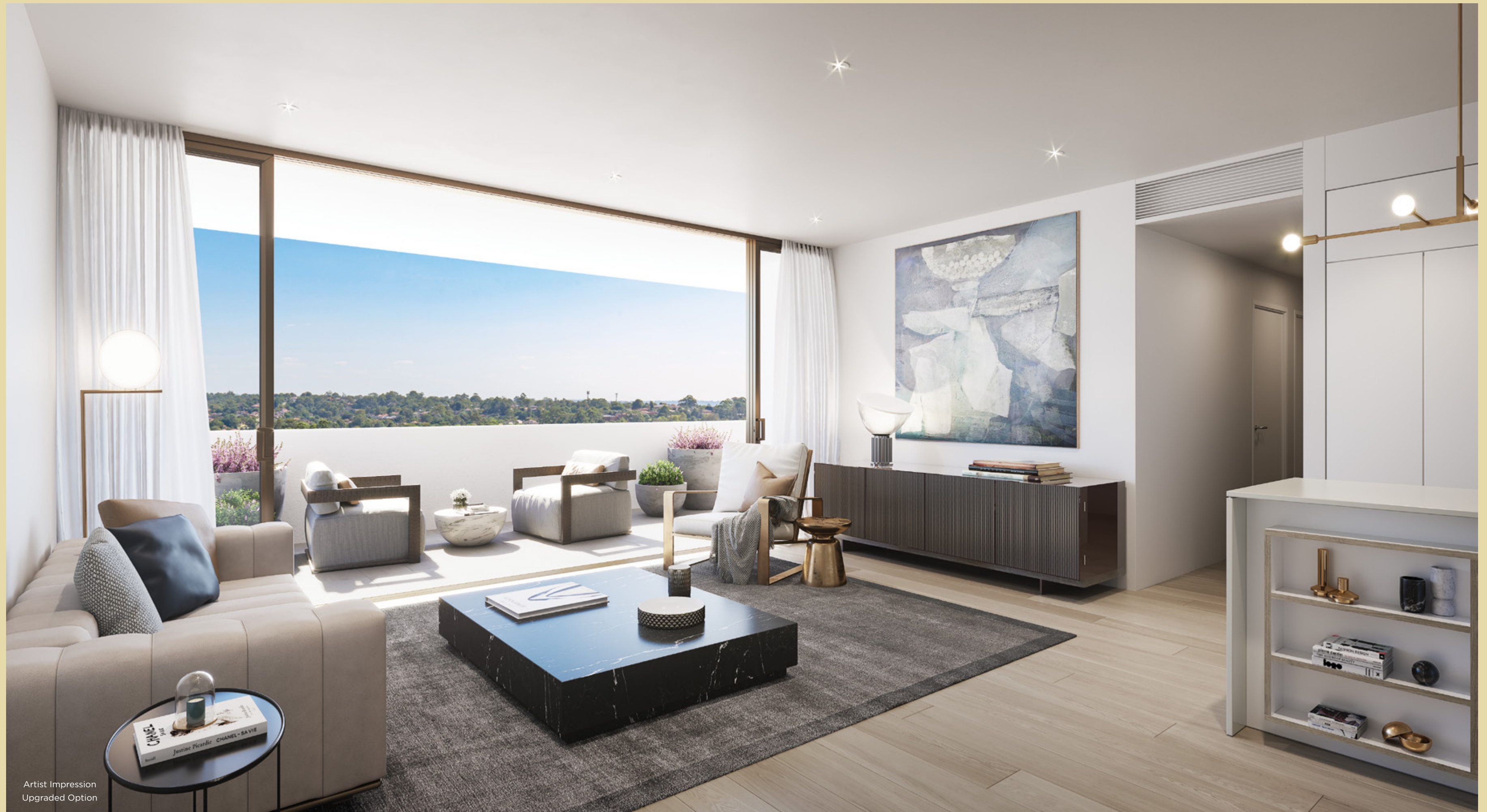
Artist Impression Upgraded Option

Opt for quality carpet in living areas or upgrade to timber floors – the choice is yours.