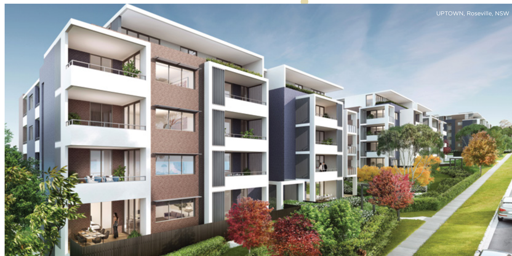
UPTOWN, Roseville, NSW