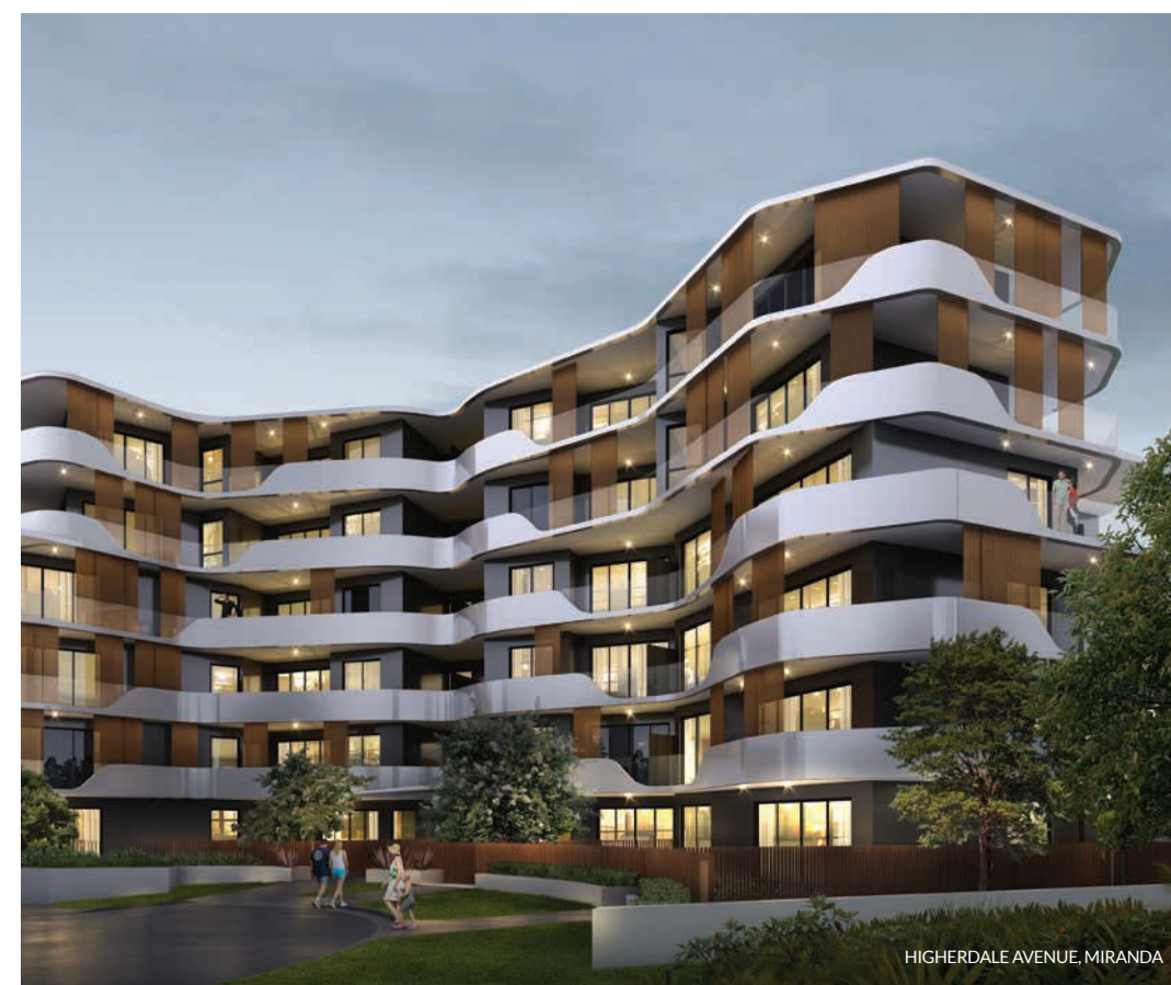
HIGHERDALE AVENUE, MIRANDA