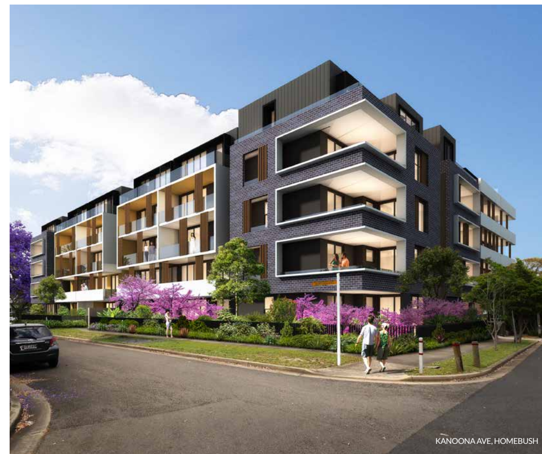
KANOONA AVE, HOMEBUSH

CDArchitects is a highly regarded architectural and planning practice drawing from more than 40 years of combined industry experience, with a strategy based around client-tailored services. Their skilled market and building specialists are supported by a highly committed team of talented architects and project managers, with wide-ranging experience in the delivery of projects across the residential, commercial, hospitality and education sectors.