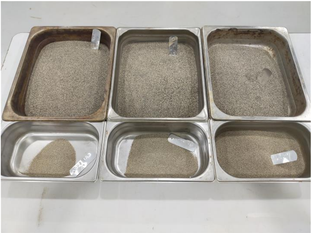
Industrial sand samples from large scale pilot plant program

Dome's activities at Sigatoka have attracted the interest of the Fiji press and we are thankful that newspaper articles recently published have been generally fair to the Company while bringing to our attention concerns of members of the Sigatoka community that will certainly be addressed as part of the DFS and EIA.