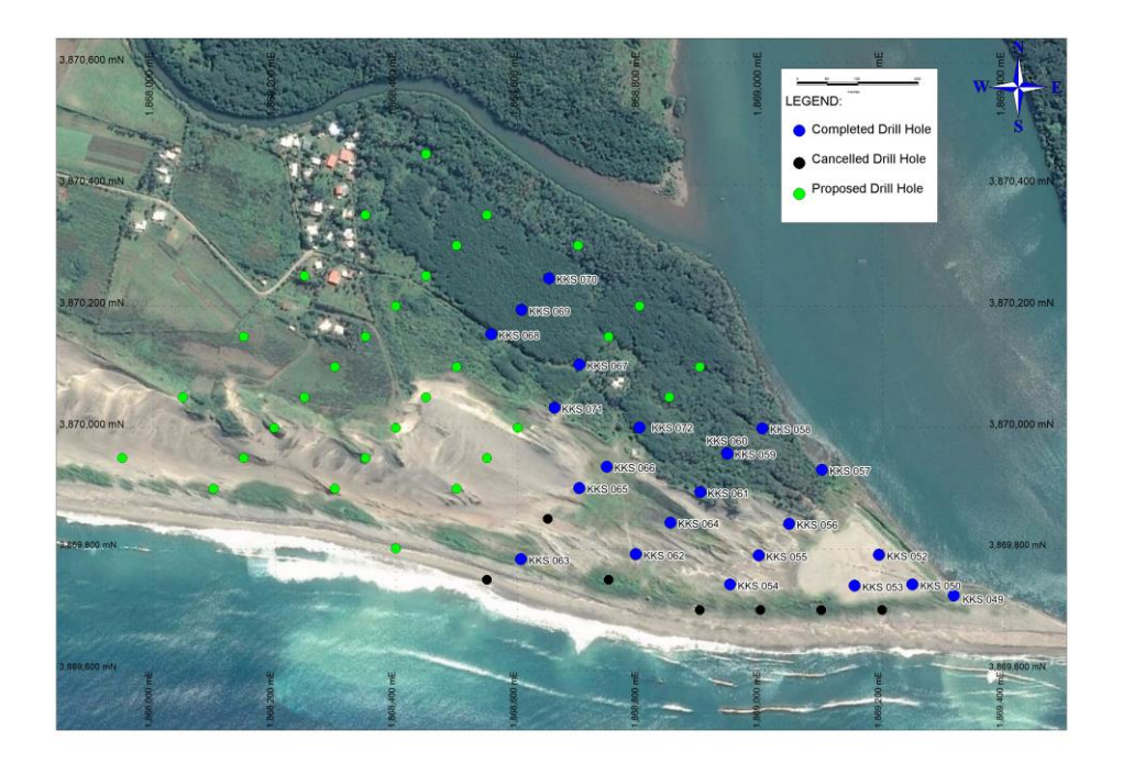
Figure 2: Expanded view of the same area, showing Kulukulu drilling status as at 25 October 2019.